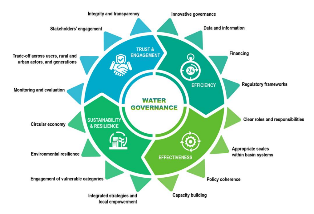
Figure 1: InnWater water governance assessment framework

This section provides key definitions for the 16 water governance principles. Further details are available in the fourth section of this document, within each principle's fact sheet.